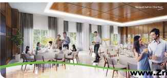
Banquet hall on 23rd floor