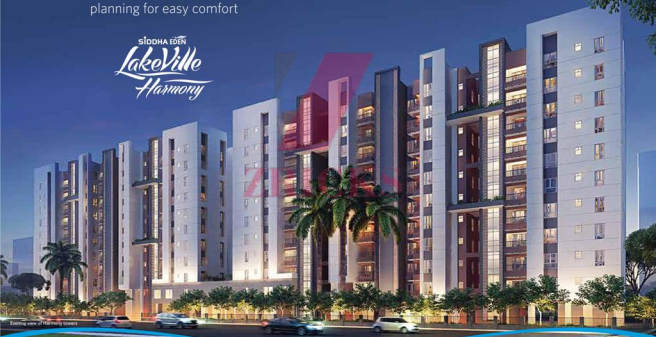
Evening view of Harmony towers

Siddha Eden LakeVille Harmony is a specially created residential space that will surround you with lush, green scenery. With access to Skywalk at 262 ft above ground level, having various carefully appointed activities and a Clubhouse, you live the high life! The two G+10 towers will bring the joy of togetherness to your life as we pamper you with harmonious living at an affordable price.