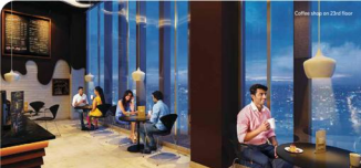
Coffee shop on 23rd floor