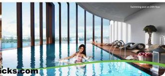
Swimming pool on 24th floor