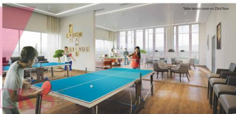
Table tennis room on 23rd floor