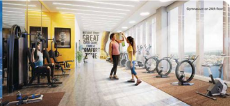
Gymnasium on 24th floor

Situated on the top two floors, scale the heights of entertainment with your family and friends at the Clubhouse for unforgettable times.